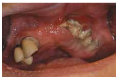
Figure 1. Exposed bone of the maxilla; osteonecrosis associated with bisphosphonate therapy.

Osteonecrosis of the jaw presents to dentists as an exposure of the mandible or the maxilla that can be either painful or asymptomatic. Although jaw necrosis can occur spontaneously without any recognized cause, most patients present with non-healing sockets following exodontia. 14 Any insult which denudes