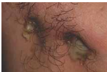
Figure 2. Discharging cutaneous sinuses.