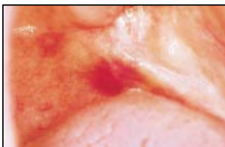
Figure 7. Kaposi's sarcoma.

This rare sarcoma has a bluish appearance and is seen almost