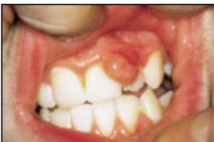
Figure 11. Pregnancy epulis.

Exacerbation of chronic gingivitis by pregnancy. Poor oral hygiene