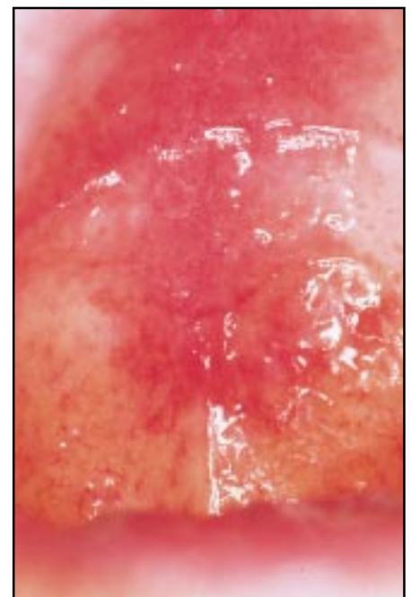
Figure 1. Candidosis: erythematous palatal lesion.

Denture-induced stomatitis is found only in people who wear appliances (usually dentures or orthodontic plates) and almost exclusively under an upper