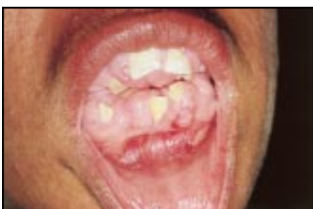
Figure 9. Hereditary gingival fibromatosis.

This is a rare, potentially lethal, disseminating granulomatous condition