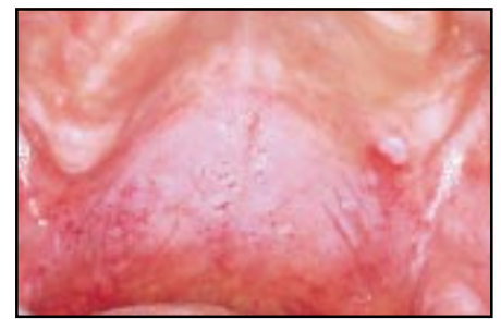
Figure 6. Smoker's keratosis.

The clinical appearance and history are so distinctive that biopsy is not normally necessary. The patient should be encouraged to stop the causative habit.