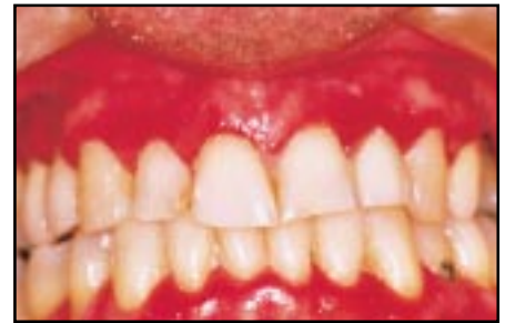
Figure 12. Desquamative gingivitis.

The diagnosis will be clear from the dietary history and clinical features. The classic investigation is assay of white cell ascorbic acid; however, this is rarely required. Vitamin C supplements should be given and the diet reformed.