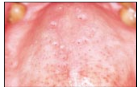
Figure 5. Smoker's keratosis.

is no characteristic type of hyperkeratotic lesion associated with the far more common habit of cigarette smoking.