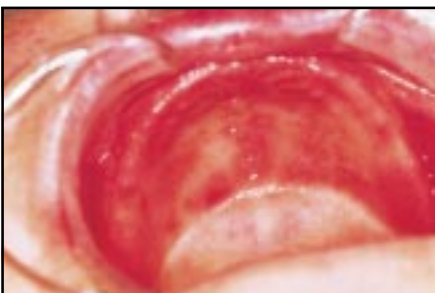
Figure 3. Candidosis: later lesions in denture-induced stomatitis.

Denture-induced stomatitis presents with erythema limited to the denture-bearing area, typically beneath a complete upper denture. Early lesions may be punctate (Figure 2) but later may become diffuse (Figure 3). After many years papillary hyperplasia may