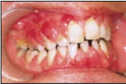
Figure 10. Drug-induced gingival hyperplasia.

edentulous sites. It is characteristically firm, pale and tough, with coarse stippling.