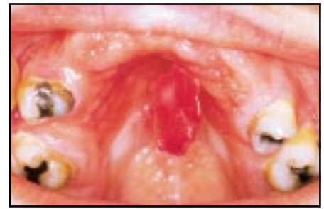
Figure 8. Fibrous lump.

Rapidly developing localized lumps, usually associated with discomfort, are most likely to be abscesses. Other localized swellings are usually inflammatory or neoplastic, and include: